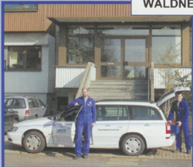
WALDNER Service - at your disposal within very short time

The DOSOMAT Service Department is your competent partner who will help you to ensure safe functioning of your machine, from first commissioning of the machine, over modifications and repairs up to regular maintenance.